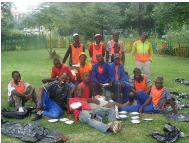
Our litter casuals relax and enjoy a meal – Thank you to Plovers Realty for paying their wages and Sunninghill SuperSpar for their food

Do you really want it on your conscience when you ruin someone's life due to inconsiderate behaviour? To our residents – should you see someone speeding or driving recklessly – please take down the number plate and make of vehicle and we will take action by reporting them and naming and shaming.